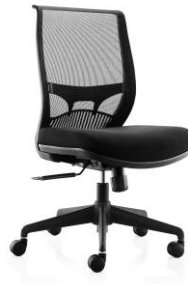
FM.B2 (Black frame no arms)

Dimensions overall 630mmW x 530mmD Seat: 470W x 495mmD Seat height: 480–580mm Back: 470W x 620mmH * Black fabric only