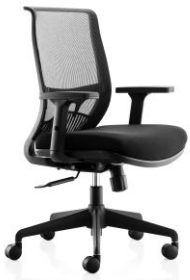
FM.B1 (Black frame with arms)

Dimensions overall 630mmW x 530mmD Seat: 470W x 495mmD Seat height: 480–580mm Back: 470W x 620mmH * Black fabric only