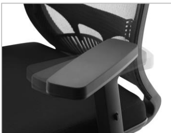
Pivorable Arm Pads