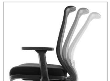
Synchro Mechanism With 3 Position Lock